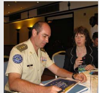
EUTM mission Commander, Colonel González Elul, and EU High Representative, Catherine Ashton, Nairobi, May 2010

In particular, the objective of the EU military mission, hereinafter called 'EUTM Somalia', shall be to contribute to a sustainable perspective for the development of the Somali security sector by strengthening the Somali security forces through the provision of specific military training, and support to the training provided by Uganda, of 2 000 Somali recruits up to and including platoon level, including appropriate modular and specialised training for officers and non-commissioned officers. The training also covers international humanitarian, human rights and refugee law, as well as the protection of civilians, including specific protection needs of women and children.